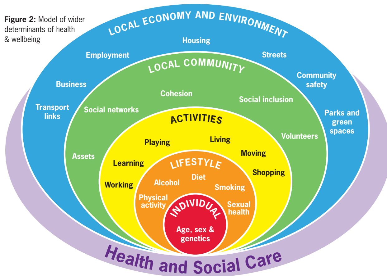
Figure 2: Model of wider determinants of health & wellbeing

Source: Modified from Dahlgren & Whitehead's rainbow of determinants of health (G Dahlgren and M Whitehead, Policies and strategies to promote social equity in health, Institute of Futures Studies, Stockholm, 1991) and the LGA circle of social determinants (Available at: http://www.local.gov.uk/web/guest/health/-/journal_content/56/10171/3511260/ARTICLE-TEMPLATE )